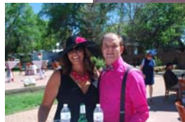
Posada's fundraiser - Juleps and Jodhpurs, a celebration of the Kentucky Derby