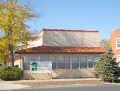
Posada Supportive Services Center 225 Colorado Avenue Pueblo, CO 81004

Posada's mission is to provide housing and supportive services that empower homeless individuals and families in Pueblo County to become self-supporting members of the community.