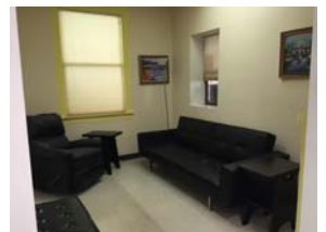
Posada's Moving-Up Center